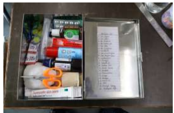
First-Aid boxes available at Strategic points