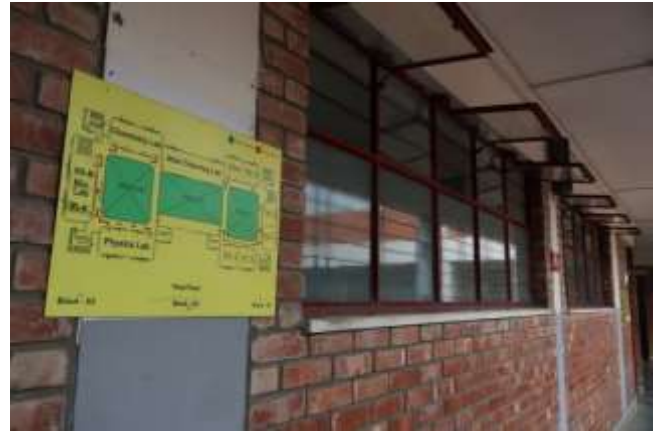
Evacuation Plan Display