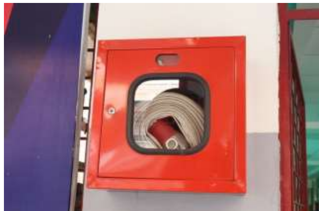
Fire Safety Instruments