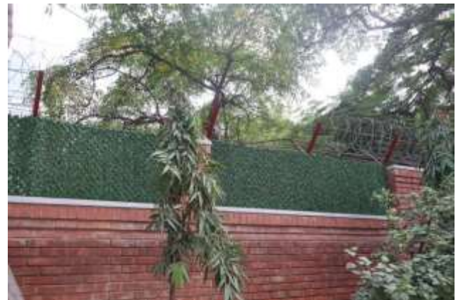
School Boundary Wall