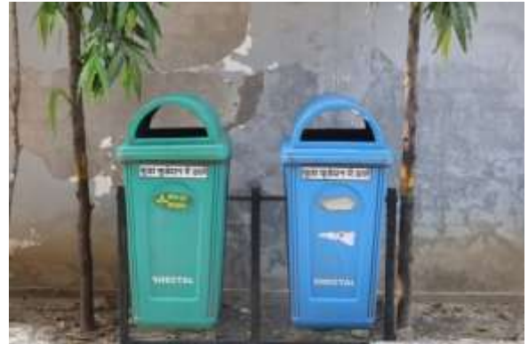
Bio-degradable and Non Bio-degradable waste collection