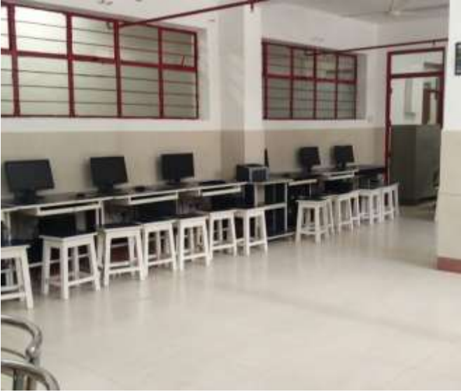
Sr. Computer Lab