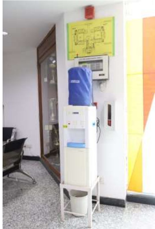
Adequate Potable Water