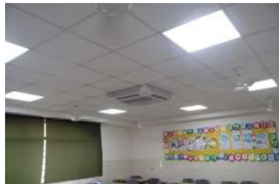
Overall Cleanliness in School