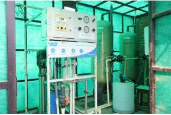
Water Filtration in School