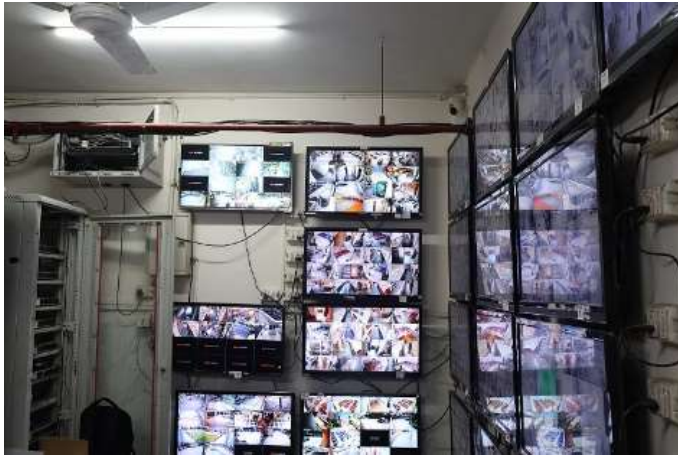
CCTV Recording Facility