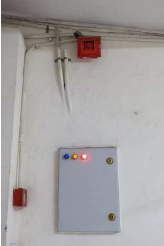
Proper Electricity and Lightning Provision