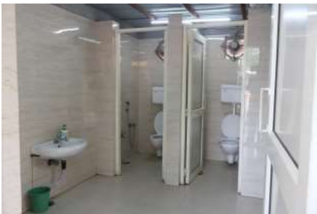
Cleanliness in Toilets