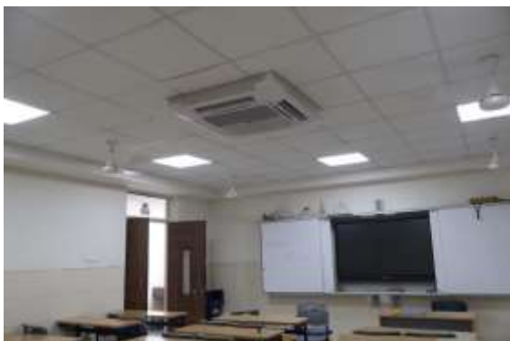
Interactive Intelligent Panels in Class rooms and Activity Areas