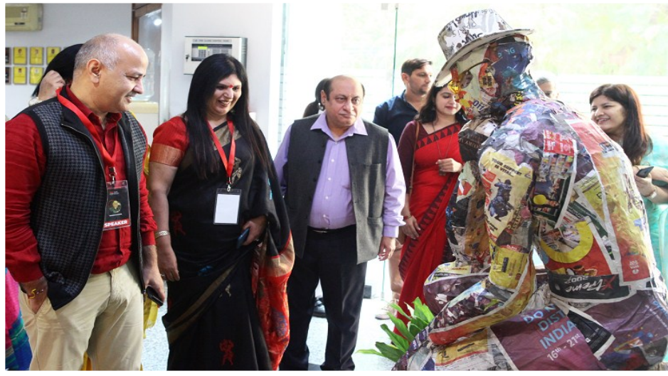
ADMIRING 'THE THINKER'