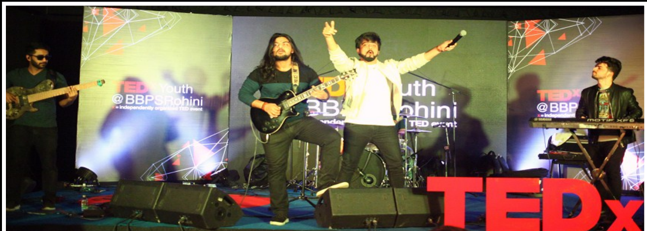
"TARKASH" "A FAMOUS INTERNATIONAL BAND CO-FOUNDED BY ALUMNI OF BBPS ROHINI"