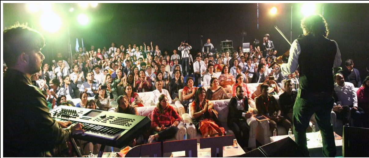
THE ENTHRALLED AUDIENCE