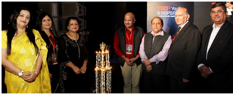
THE ESTEEMED MEMBERS OF THE MANAGEMENT