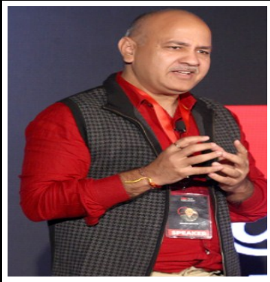
MR. MANISH SISODIA DEPUTY CHIEF MINISTER OF DELHI TOPIC: "DELHI'S EDUCATION REVOLUTION"