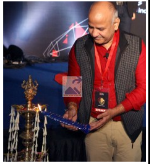
LIGHTING THE LAMP