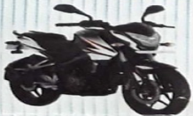
Pulsar NS 200